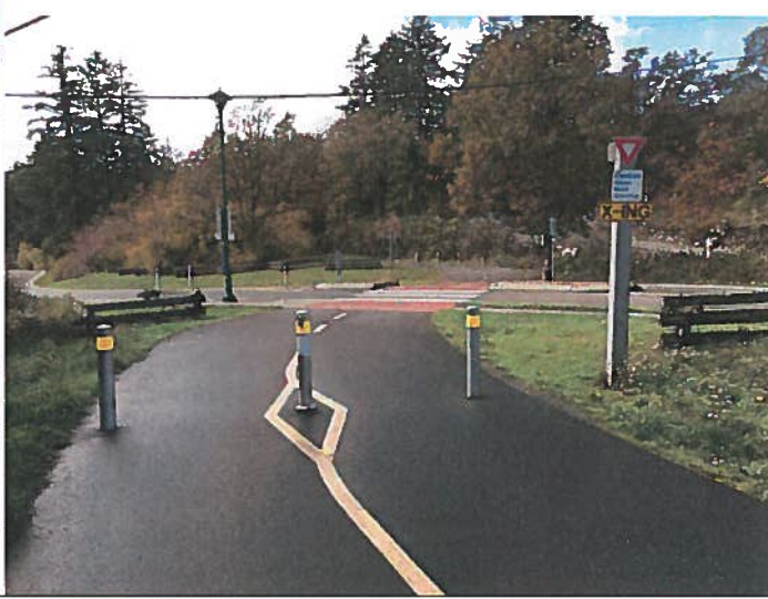
Why are outer bollards placed within path. Silver bollards are not very visible compared to white bollards.