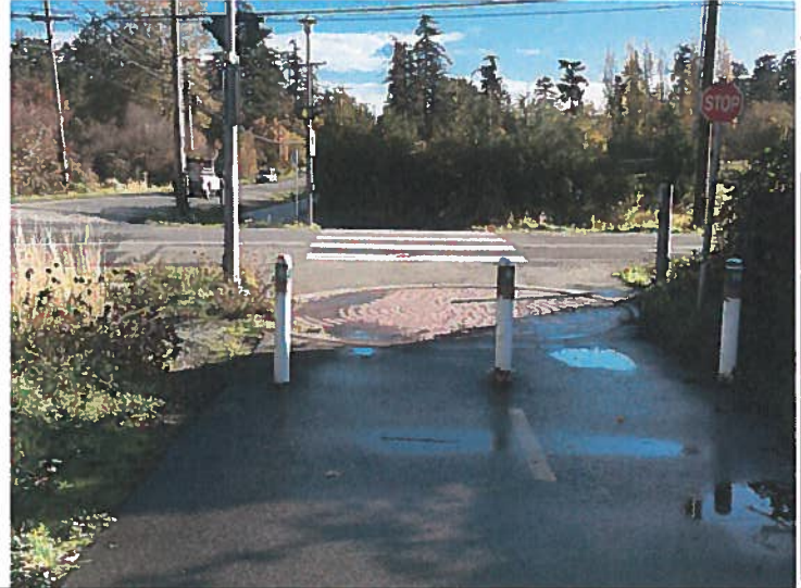
Lochside at Blenkinsop Rd. No bollards on far side but bollards at every road and driveway along Mt Douglas X Rd despite the fact cars could easily cross gravel boulevard between road and trail.