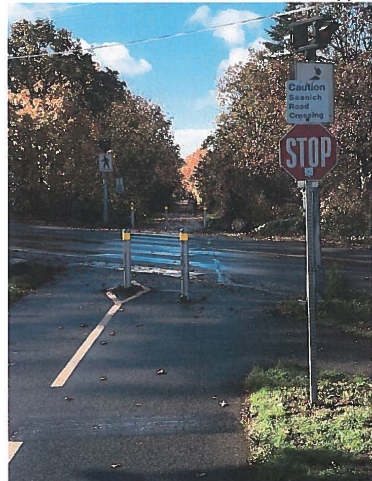
Lochside at Saanich Rd. Bollards block travel path