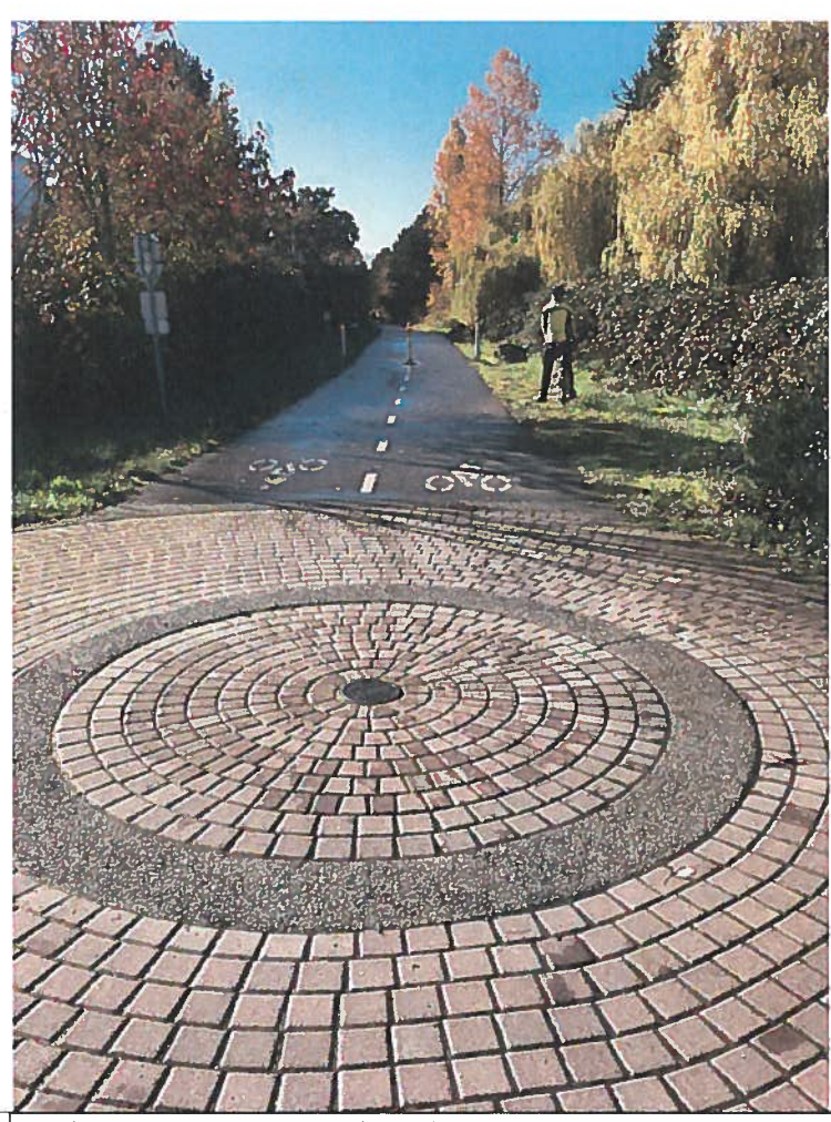
Lochside at McKenzie and Borden. Why have any bollards here?