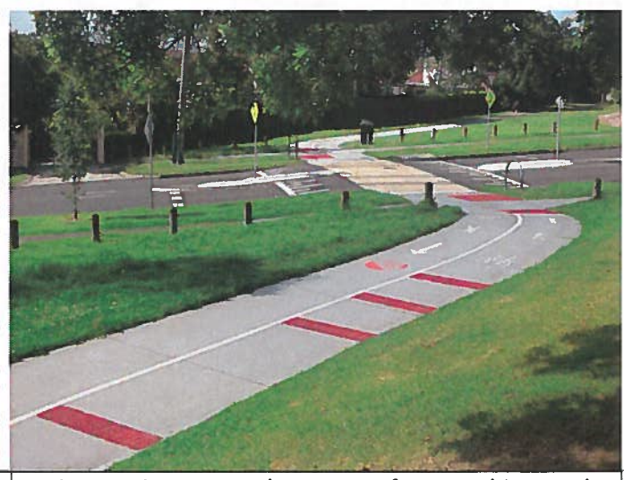
An interesting approach to warn of approaching road interface